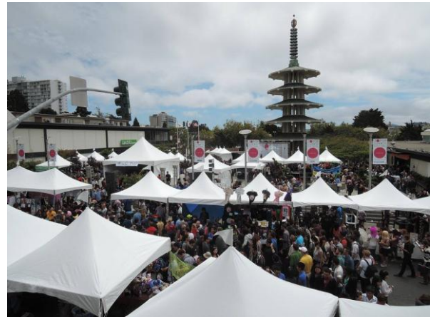
SF Japantown during this year's J-POP SUMMIT

To learn more about the Consulate at this year's J-POP SUMMIT Festival and see additional photos, please see our website and Facebook page.