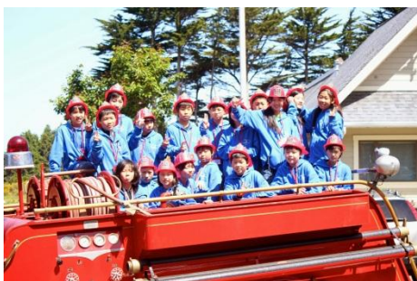
Miasa students at the Volunteer Fire Station