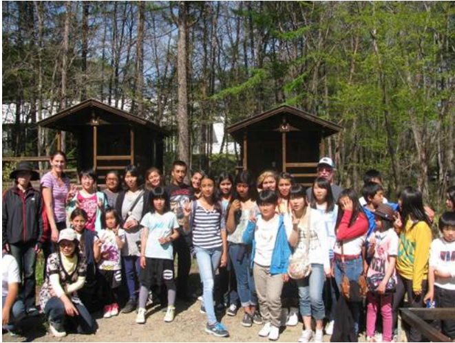
Watsonville students with their new friends from Kawakami-mura