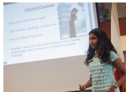
Student describes what she wants to explore in Japan