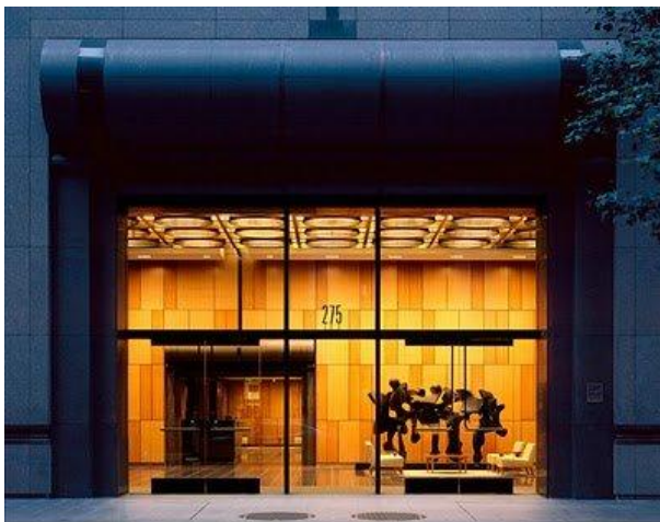
The Consulate is now located at 275 Battery St. in SF