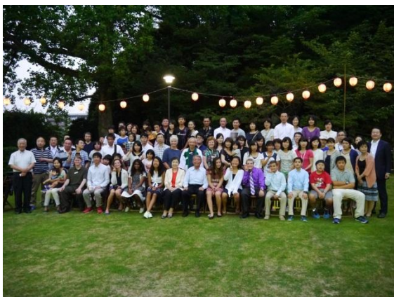
Sunnyvale students and their new friends in Iizuka